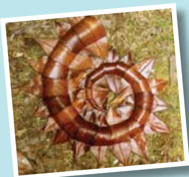
Leaves polished and greased, pinned to the ground with thorns.

Why don't you try making one next time you visit the coast?