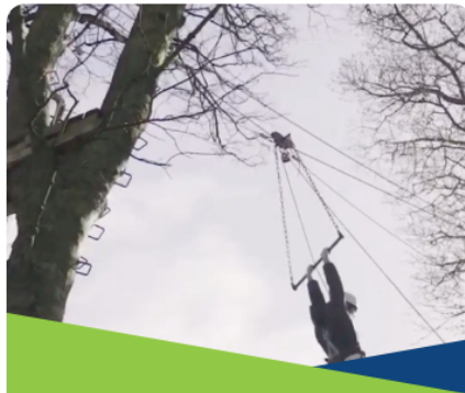
Leap Of Faith